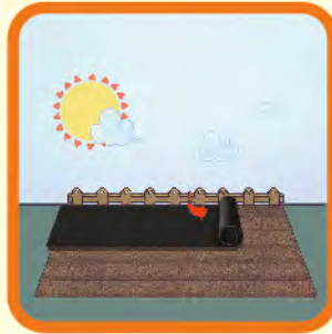
02 STEP → Lay out the weed barrier