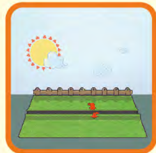
08 STEP → Put down the edges