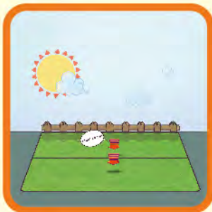
09 STEP → Step on the seaming and edges