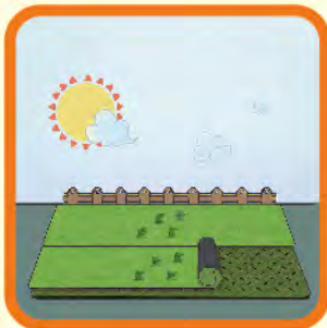
05 STEP → Keep the yarn direction consistently