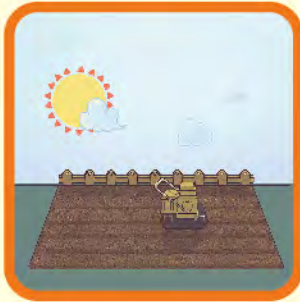
01 STEP → Compact the sub base