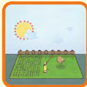
11 STEP → Sprinkle and level the quartz sand (optional)