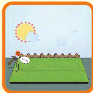
10 STEP → Fix pins/nails