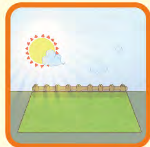
12 STEP → Enjoy