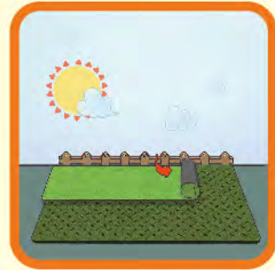
04 STEP → Lay out the grass roll