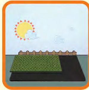
03 STEP → Lay down the shock pad (optional)