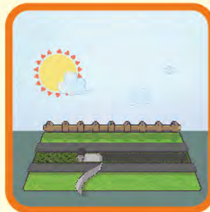
07 STEP → Fold the trimmed edges; put the adhesive tape below the edges