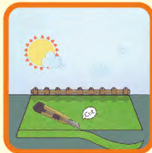
06 STEP → Trim edges